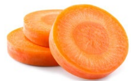
VITAMIN A Retinyl palmitate