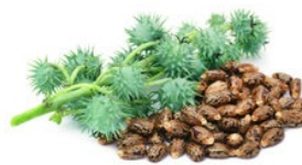
CASTOR OIL Ricinus communis